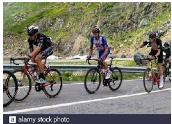
Tour de Roumanie