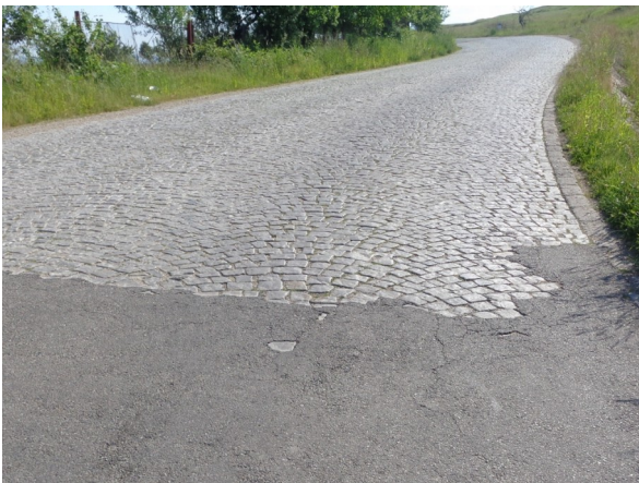
Stana de Vale

In the west, the biggest climbs lie between 1000 and 1500m, between Beius and Cluj-Napoca : Buscat, Stâna de Vale and Semenice, the Beliș-Fântânele and Drăgan lakes, Padiș plateau or the Urșoia and Vârtope passes.