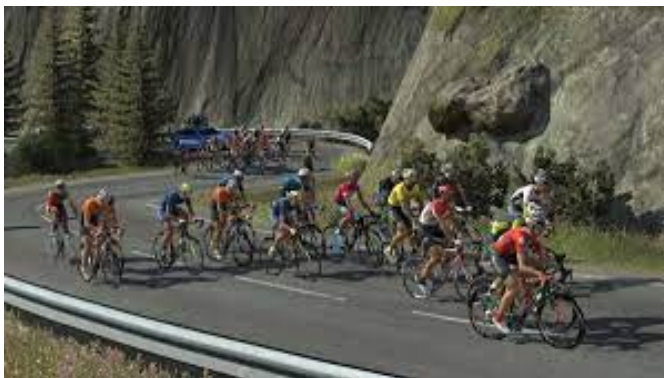
Tour de Szekerland

A few climbs are used in the Tour of Szeklerland (Harghita-Băi, Șicas and Ghimeș, Cașin and Calonda passes) or in the Cycling Tour of Romania.