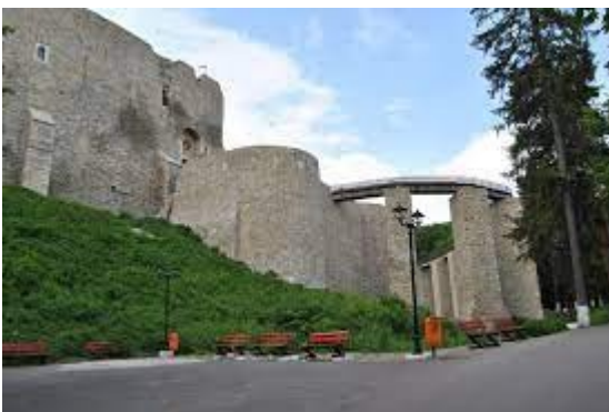
Citadelle de Târgu Neamț

The Subcarpathians are represented by a fortress above Târgu Neamț, three monasteries (Ciolanu, Dealu and Probota at the foot of Tătăruși), a road from the Danube (Ghelnegioaia), Tohani vineyards (in Jugureni) or a climb of the very first Tour of Romania in 1935 (Petricica on the outskirts of Bacău).