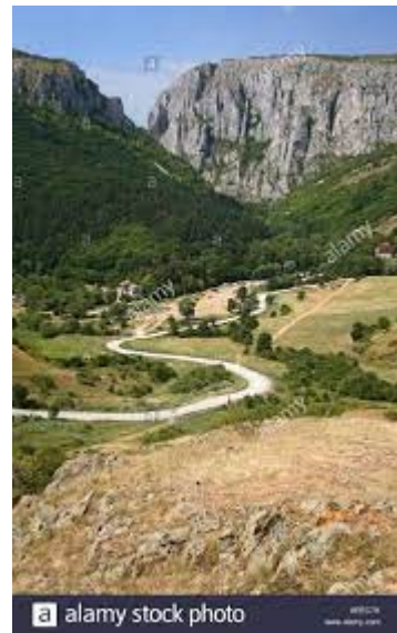
Gorges de Cheile

The Subcarpathians are represented by a fortress above Târgu Neamț, three monasteries (Ciolanu, Dealu and Probota at the foot of Tătăruși), a road from the Danube (Ghelnegioaia), Tohani vineyards (in Jugureni) or a climb of the very first Tour of Romania in 1935 (Petricica on the outskirts of Bacău).