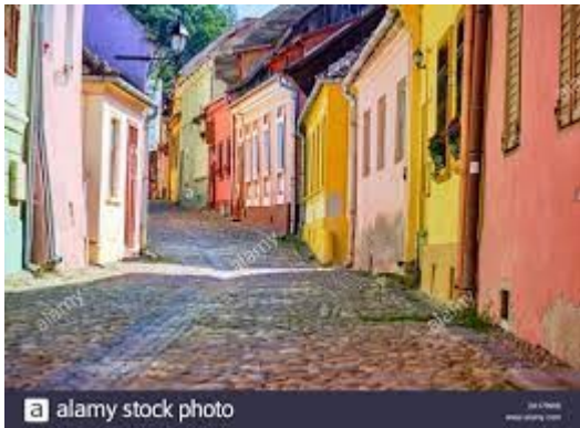
Pavés de Sighisoara

On the Transylvanian Plateau, besides the cobbled streets in the historic centre of Sighișoara and the Nicula monastery in Gherla, a few climbs used in the Tour of Sibiu (Dealul Dăii, Pelișor and Ruși) have been selected, as well as the Cheile (gorges) Babei towards Coroieni.