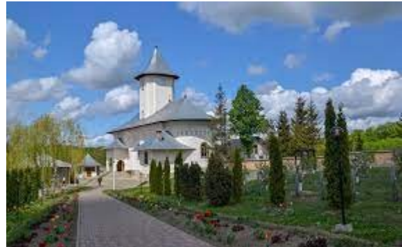
Monastère de Gorovei

The obvious will of the Romanian authorities to develop the road network in order to increase the touristic supply allows to envisage increasing the number of paved climbs and, therefore, enriching the list.