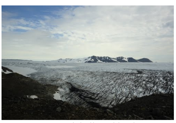
Vatnajökull à Jöklasel

At the most western place, Látrabjarg cliffs house a bird reserve, with a large puffin colony.