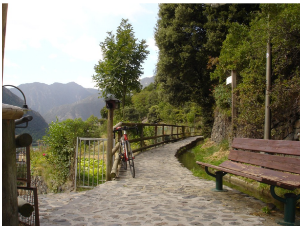
Rec de Solà

Taste the shortest climb called Urina, taste the views on Andorra city available in the Rec de Sola road