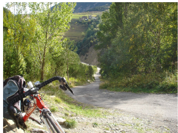
Camí del Riu d'Urina