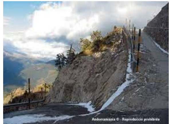
Pic de Carroi

Taste the shortest climb called Urina, taste the views on Andorra city available in the Rec de Sola road