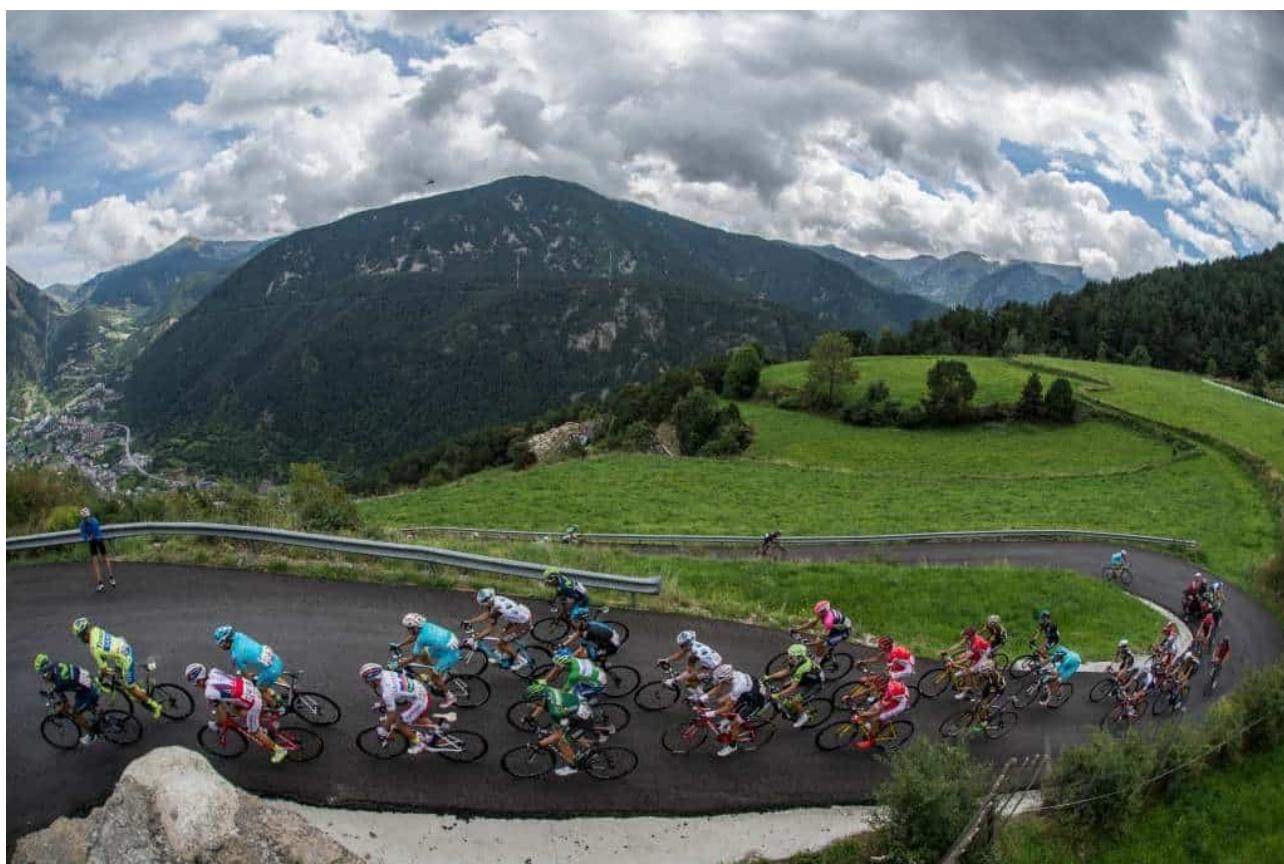
The Vuelta in Andorra