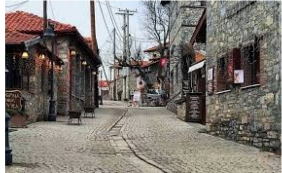
The cobbles of Kaimaktsalan

As for explosiveness, here are the top 10 bombs