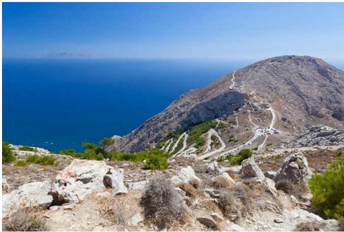
The Profiti Ilía serpentine