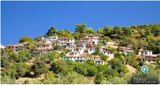
The village of Sotiras in the heart of Thassos