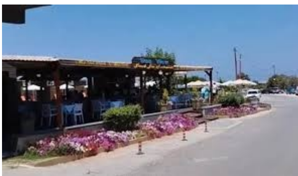
Arrival at Café Psiloritis