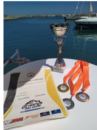
Medals and trophies from the Olympus Hill Climb