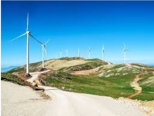
The end of Panachaiko