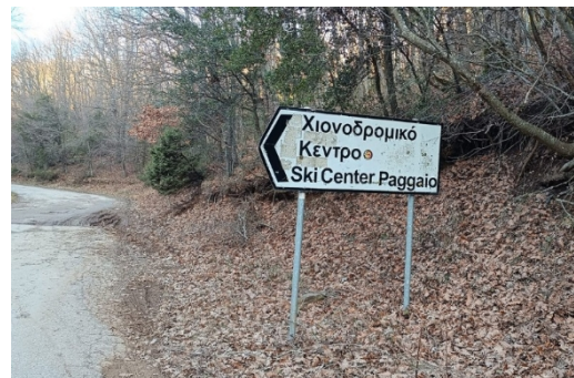
To Paggaios, follow the arrow