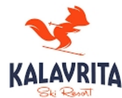
Or to Kalavrita