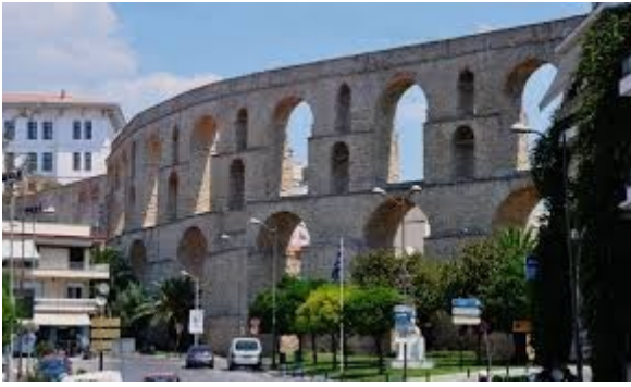
The Roman aqueduct at Kavala