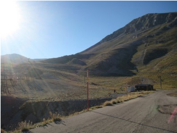
The Fterolaka road