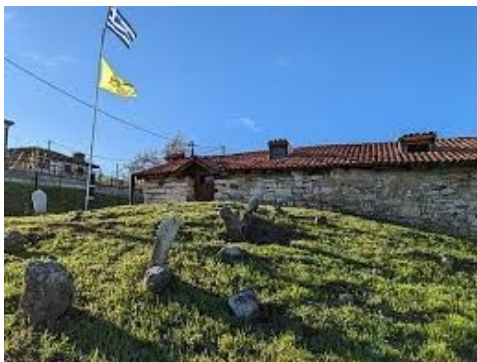
Greek flag on Metaxades

GRE-099 Párko Metaxades Natural park GRE-197 Karabola-Parnitha Nature reserve, monuments, panorama