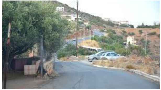
The Ellinika road