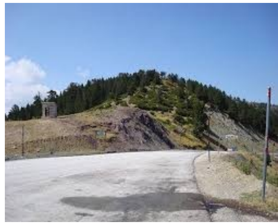
The Katara pass