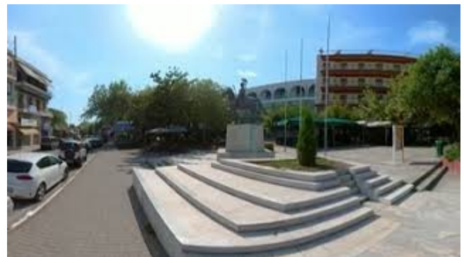
Kirkis monument on stairs