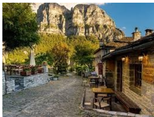
The cobbles at the end of Megalo Papigko