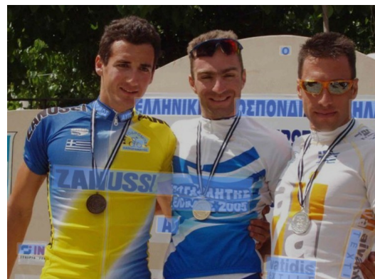
Vasilis Anastópoulos, gold medallist in 2005