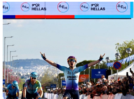
The Tour of Hellas finish banner