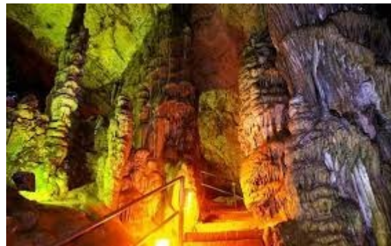
The bowels of the Dikteon Antron