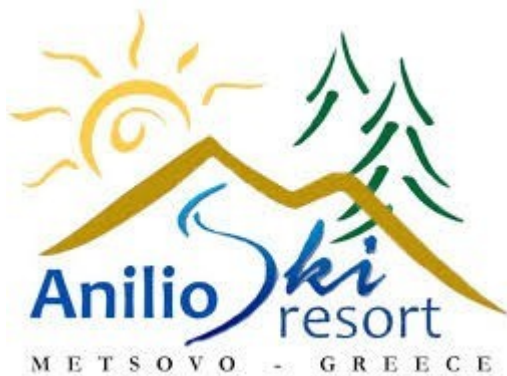
Invitation to ski at Anilio