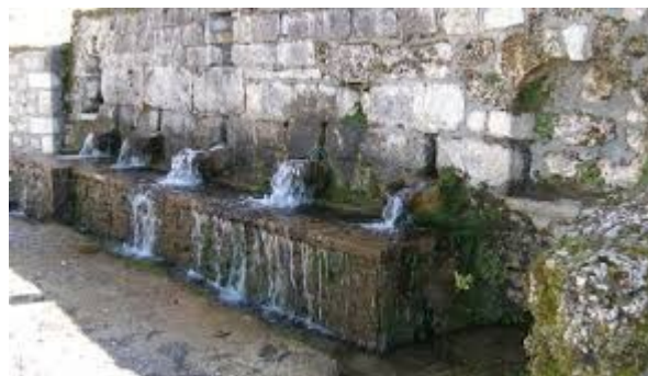
Small fountains of Vargiani