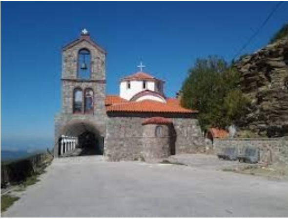
Arrival at the Vlasti Monastery