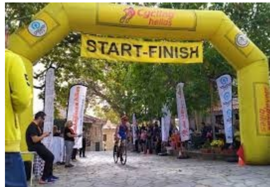
The finish of the Kissavos Hillclimb