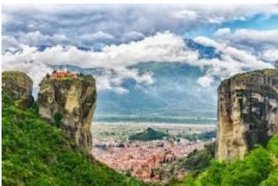
The extraordinary site of Kakolakkos