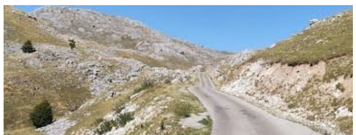
The road to Pliasidhi (Quäldich)