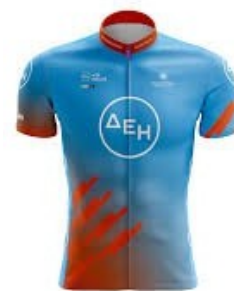
The Tour jersey