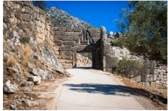
The entrance to Mycenae