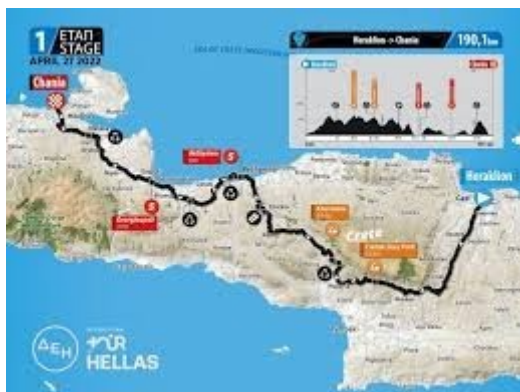
The first stage of 2022