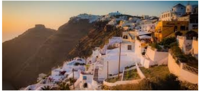
And Imerovigli in the heart of Santorini