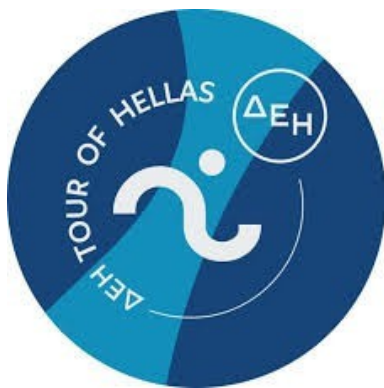
The Tour of Hellas logo