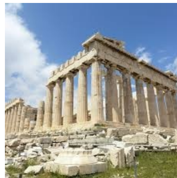
The famous Parnitha