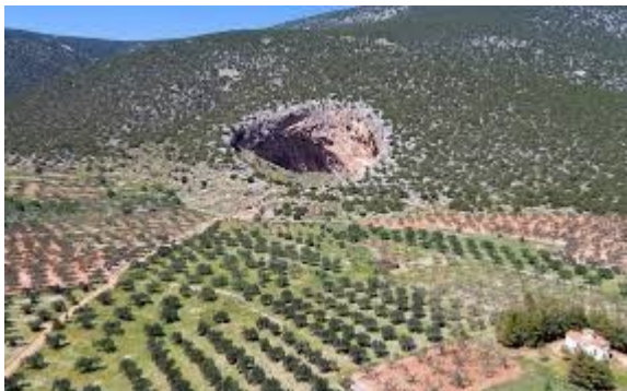
Didima is open for business