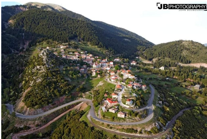
The Kerasochori winding roads