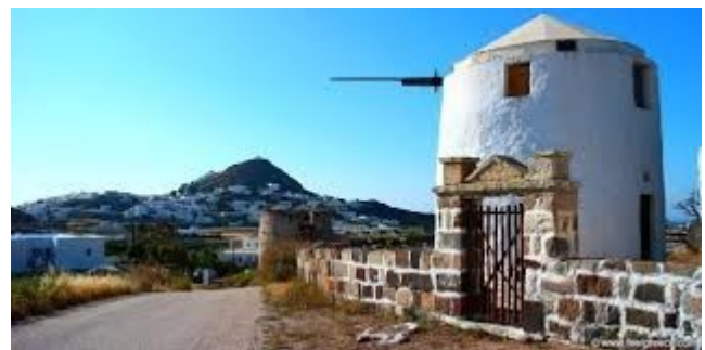
One of the Trypiti mills