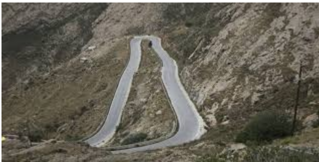
The Livadi panoramic road