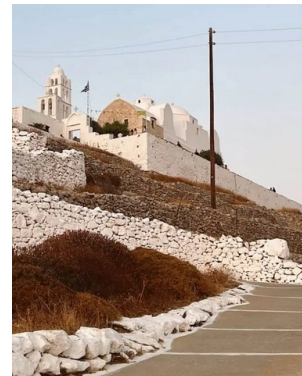
The Panagia road, asphalted in quadrilaterals