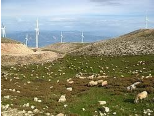
This turbine at Panachaiko

Wind farm Wind turbines Wind farm Wind farm