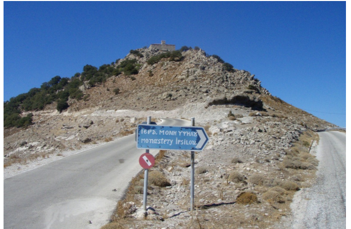
For the Monastery of Ipsilou, turn right!