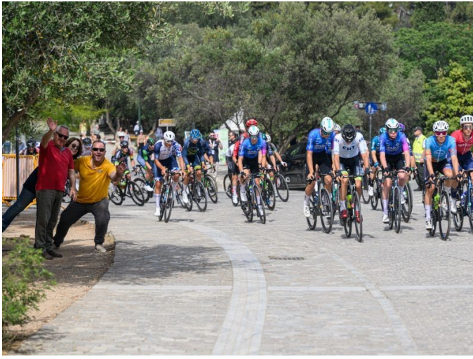
The Tour peloton towards Arachova