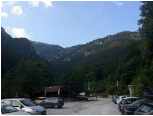
Prionia car park under Mount Olympus