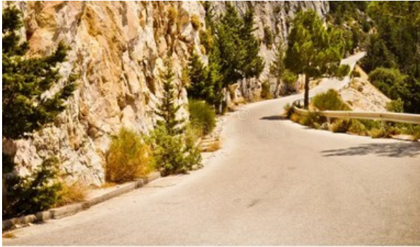
The road to Kallithea óros

GRE-291 Kallithea óros (incl. Knossos) (Kritis) UNESCO - Passage via Knossos