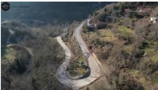
The road to the Tympanos pass