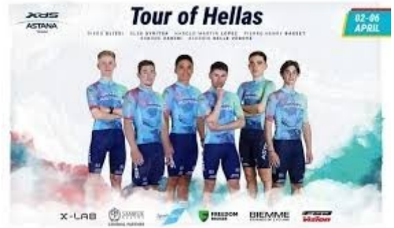
Team Astana ready for the Greek climbs