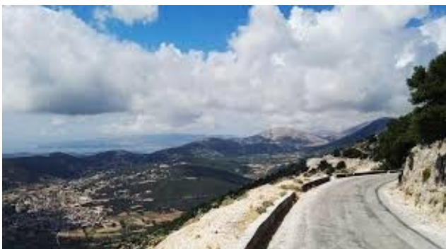
Enos and its road overlooking the island of Kefalonia