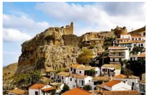
The site of Samothrace