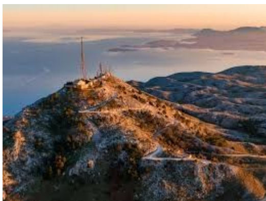
The winding road of Pantokrator