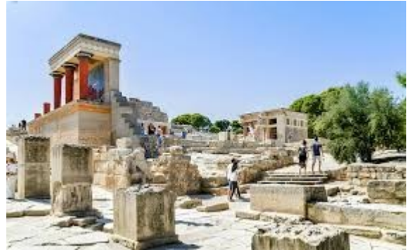
Climb it to put your stone on it