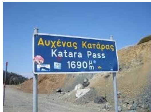
The highest altitude of a Greek pass at Katara Pass