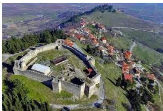
The curves leading up to Fanari Castle